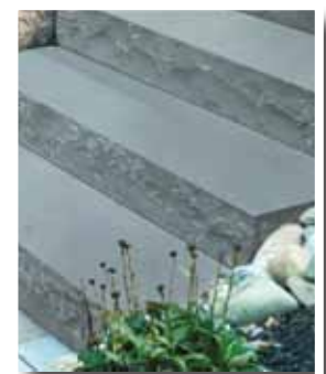
Castle Grey Step