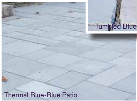
Thermal Blue-Blue Patio