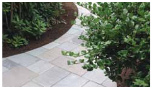
Full Color Natural Patio