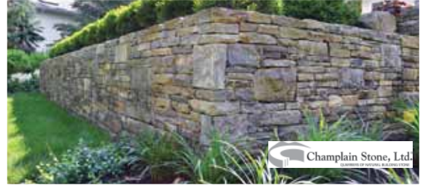
Ticonderoga Cottage Wall