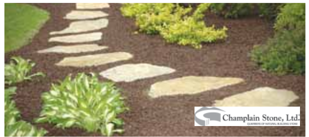
South Bay Quartzite Flagging

Champlain Stone offers a variety of high-quality natural granite, quartzitic sandstone and limestone products. Their line includes wall stone, flagging, steps, and veneers. The natural colors and textures of this uniquely indigenous stone will enhance any landscape.