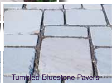
Tumbled Bluestone Pavers