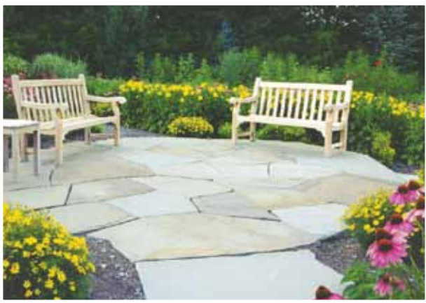
Full Color Natural Stand-up Flagging