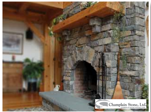
American Granite Ashlar Veneer

Champlain Stone offers a variety of high-quality natural granite, quartzitic sandstone and limestone products. Their line includes wall stone, flagging, steps, and veneers. The natural colors and textures of this uniquely indigenous stone will enhance any landscape.