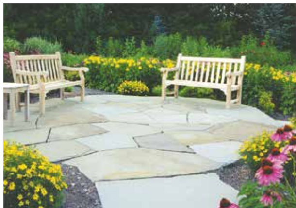
Full Color Natural Stand-up Flagging