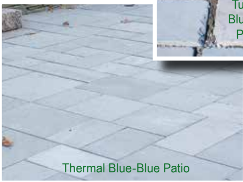
Thermal Blue-Blue Patio