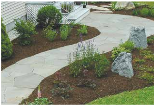
Full Color Colonial Flagging