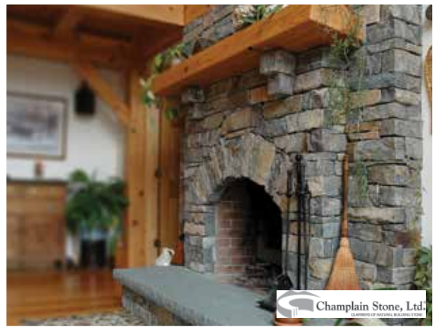
American Granite Ashlar Veneer

SAVE MONEY!! PICK-UP IN TAX-FREE NEW HAMPSHIRE!! • SAVE MONEY!! PICK-UP IN TAX-FREE NEW HAMPSHIRE!!