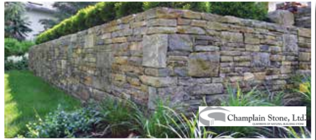
Ticonderoga Cottage Wall

Champlain Stone offers a variety of high-quality natural granite, quartzitic sandstone and limestone products. Their line includes wall stone, flagging, steps, and veneers. The natural colors and textures of this uniquely indigenous stone will enhance any landscape.