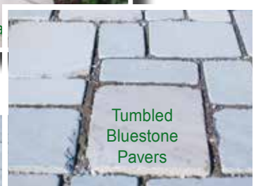
Tumbled Bluestone Pavers