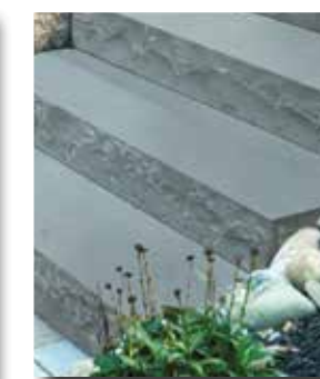
Castle Grey Step