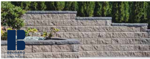
AB Classic Wall