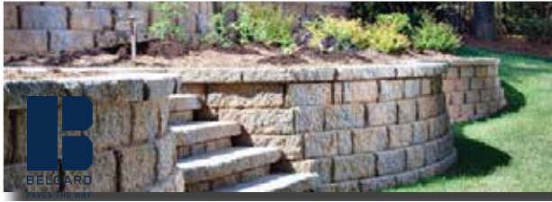
9D by Anchor