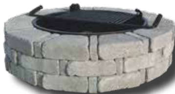
Rumblestone Round Fire Pit #1 $447.28 (Includes Insert w/grate)