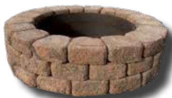
Country Side Fire Pit $341.35 (Includes Round Insert w/o grate)