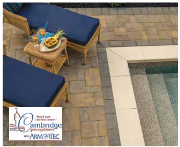
Crusader 12" x 24" Cap

SAVE MONEY!! PICK-UP IN TAX-FREE NEW HAMPSHIRE!! • SAVE MONEY!! PICK-UP IN TAX-FREE NEW HAMPSHIRE!!