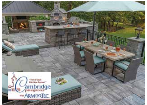
Sherwood Ledgestone 3-Piece XL Design Kit