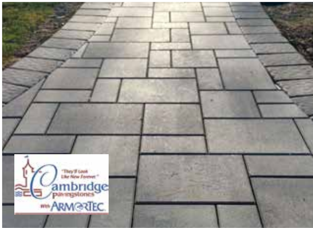
Sherwood LedgeStone 3-Piece Design Kit Smooth