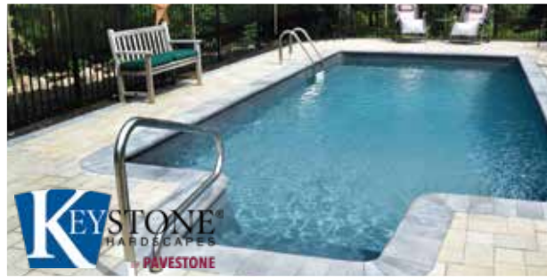
Bull Nose Paver