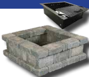
Rumblestone Square Fire Pit #1 $474.56 (Includes Insert w/grate)