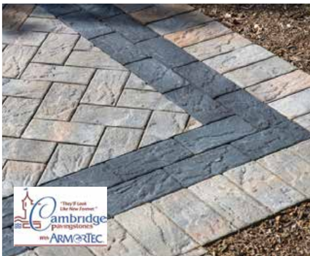
Sherwood LedgeStone 4 1/2" x 9"

Bluestone Blend (textured) Layer - 11.4 sq. ft. $63.84 Pallet - 114 sq. ft. 638.40