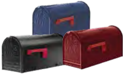
Janzer Black, Blue, Bronze, Burgundy, Gray, Taupe

Made entirely of aluminum, our USPS approved, heavy duty rural mailboxes feature a 1/8" thick extruded aluminum body with a 1/8" thick die cast aluminum front door and rear cover. Heavy duty rural mailboxes also feature a durable powder coated finish available in many contemporary colors and include an adjustable signal flag and magnetic door catch. The die cast door is attached to the body with a full-width stainless steel hinge allowing for smooth operation. All of our heavy duty rural mailboxes can be mounted on a granite post. For a complete selection of our mailboxes visit our showroom or website.