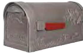
Hummingbird Silver or Black