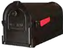
Savannah Curbside Black, Bronze, Copper or Silver