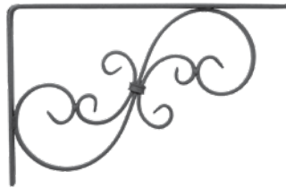
Victorian Scroll Bracket - Steel