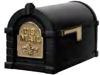
Gaines - Fleur-de-lis

Whether it be on your post or mailbox, we have many house numbering options available which include engraving, vinyl or metal numbering. See an associate for details.