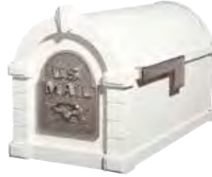
Gaines - Eagle